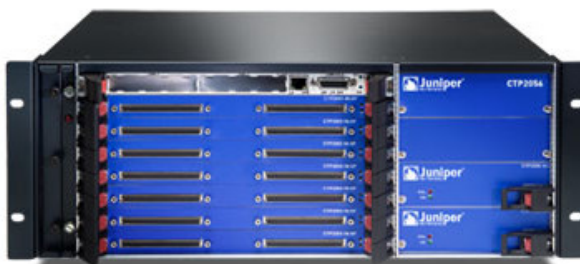
CTP2056 Circuit to Packet Platform