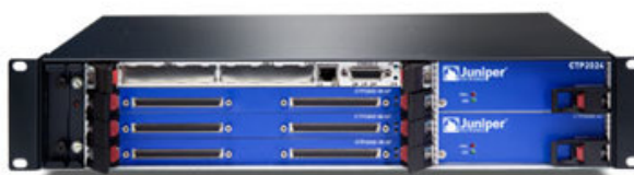
CTP2024 Circuit to Packet Platform